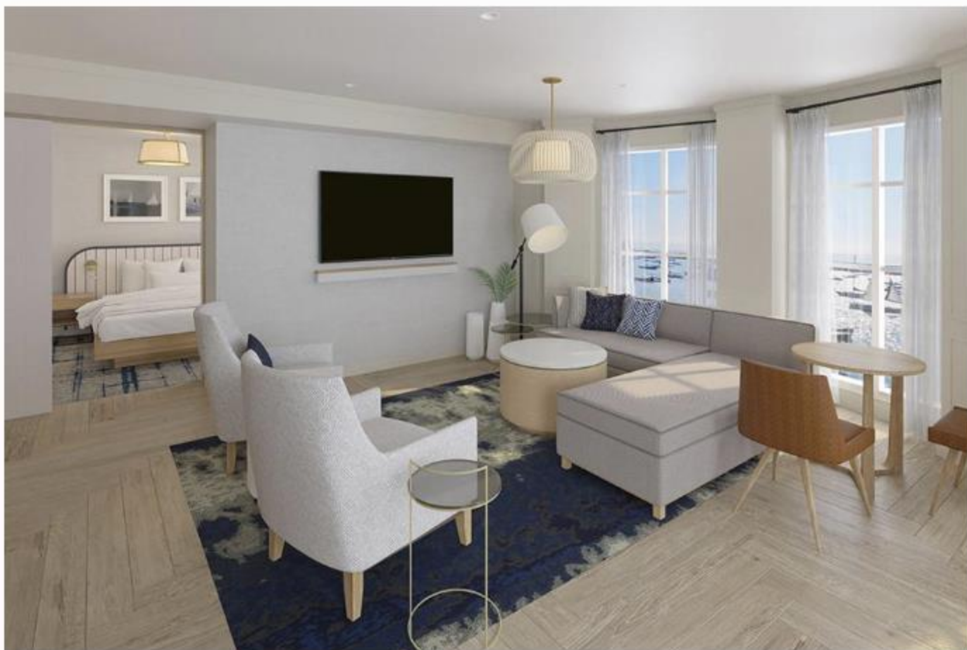
A boutique stay in Newport. BRENTON HOTEL

Forbes Travel Guide gathered some of the luxury hotel openings that should be on your radar. Whether you bookmark these destinations for a future trip or book a stay now to be among the first guests, our list of 16 brand-new hotels to visit this year (or beyond) will give you some travel inspiration.