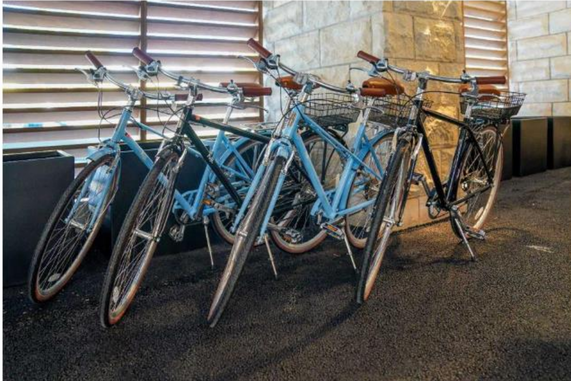
Guests can use one of the complimentary bikes on property.

A time-honored tradition of Newport Harbor, boating and sailing is one of the best ways to experience Newport like a local. In the marina just steps from the boutique property is docked Brenton One , the hotel's private 36-foot Hinckley Picnic Boat. Private charters can be reserved by the hour for groups of up to eight guests.