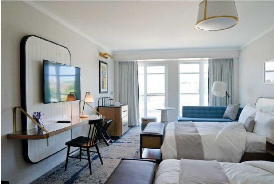
The rooms are spacious and filled with light

Distinctively Newport from experience to architectural design, the Brenton Hotel evokes the feeling of staying on an extravagant yacht.