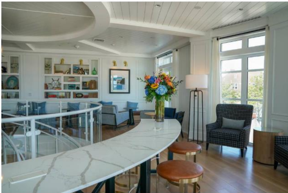
The Brenton Hotel

The Brenton Hotel , which opened in July, is a luxury boutique property that sits directly on Newport's bustling waterfront and features 57 rooms and suites. Floor-to-ceiling windows throughout the Brenton's public spaces and guest rooms offer panoramic views of the harbor and historic cityscape. Rooms and suites are quite spacious, with rooms starting at 450 square feet and suites at 1,100 square feet. Exclusive experiences include the hotel's private 36-foot Hinckley Picnic Boat, ready to whisk guests away for private escapes and intimate sunset sails around the bay and Peloton bikes that can be delivered to individual guest rooms for use.