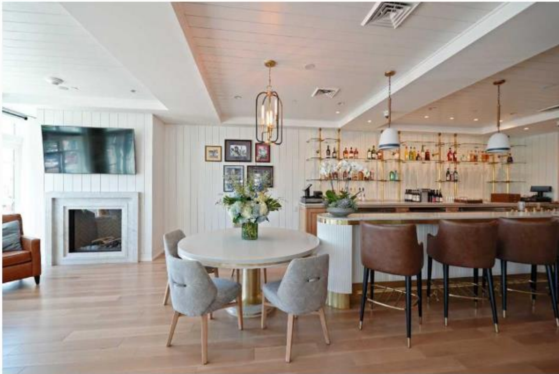
The Living Room is a casual place to enjoy drinks and food.

The highly anticipated opening of the Roof Top has some of the most sought-after views in town. Shared plates and craft cocktails, as well as beer and wine, can be ordered. Lush succulents and greenery make it feel like a garden in the sky. Cornhole, foosball, and Ping-Pong are available in warmer months, and heat lamps and firepits make it cozy when the weather turns.